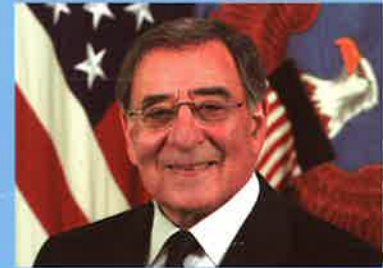
Former CIA Director Leon Panetta Analyzes New Cyber Attack Risks