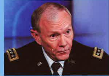
Joint Chiefs Of Staff Chairman Gen. Martin Dempsey Discusses Security